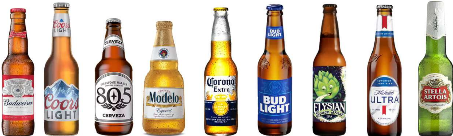
805, Budweiser, Budweiser Lite, Coor's, Coor's Light, Corona, Michelob Ultra, Modelo, Stella Artois and Space Dust IPA.