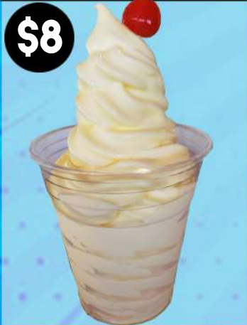
DOLE SOFT SERVE®