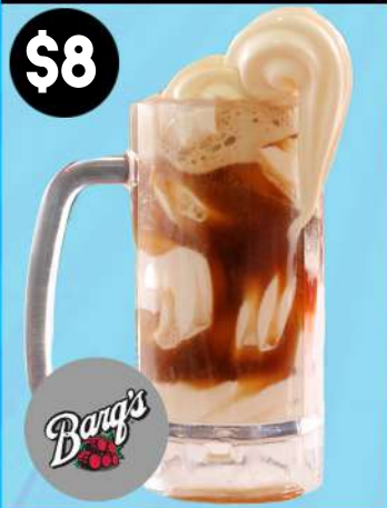
ROOT BEER FLOAT